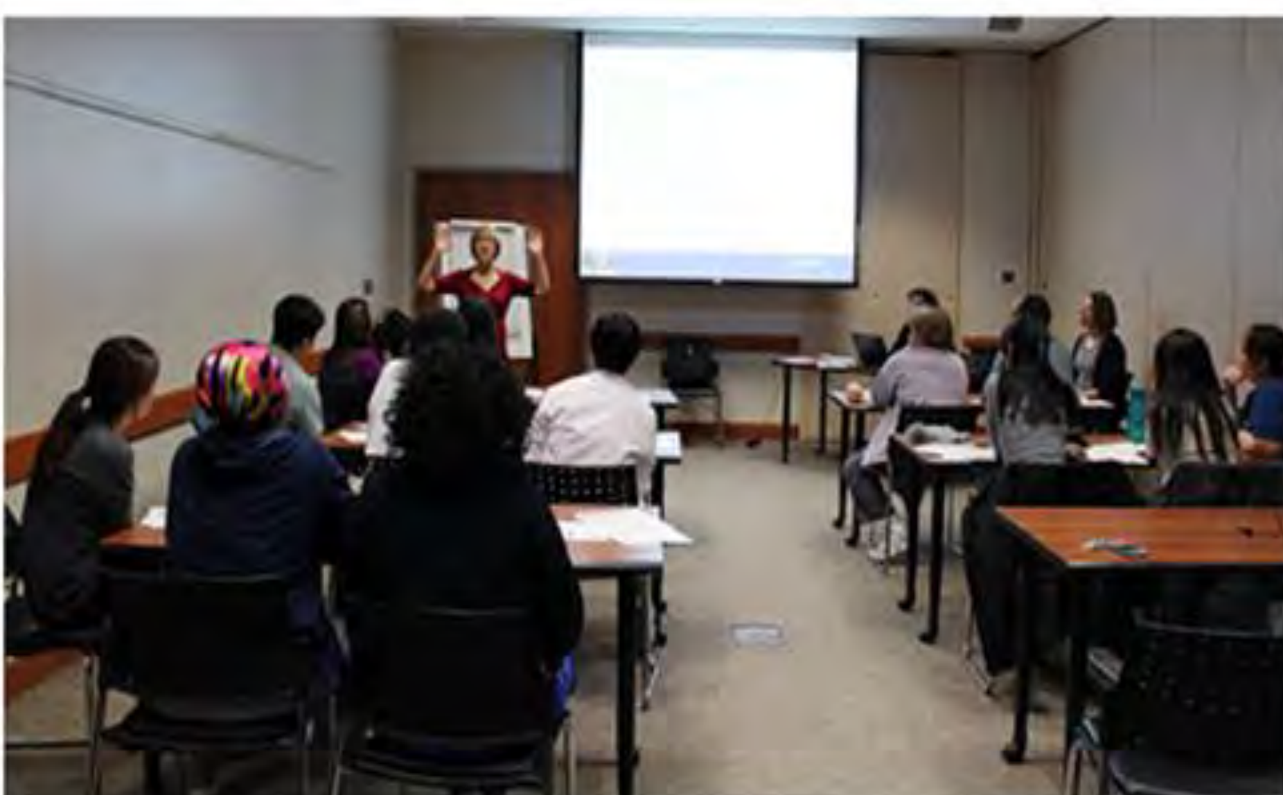
Team members from 8 west attended the workshop to strengthen their skills at managing responsive behaviours in dementia.

This project aligns with the NYGH vision of achieving excellent patient-centered care through enhanced education, research and innovation