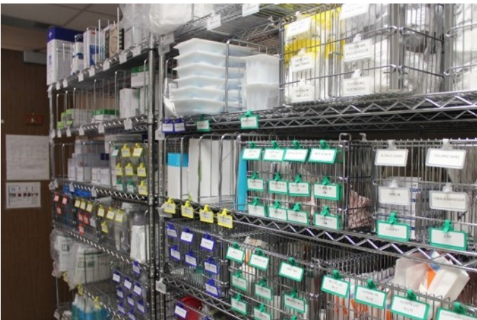
(after organizing workspace)